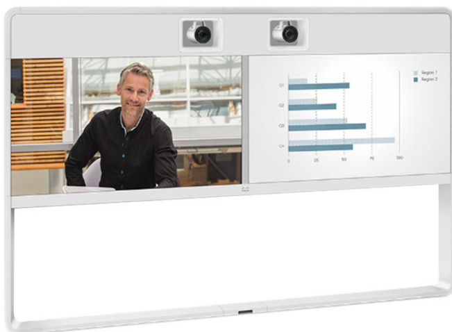
Figure 1. Cisco TelePresence MX700 Features Dual 55-inch Screens (Dual Camera Shown is Available as an Option for Both the MX700 and MX800)

Industry standards compliance lets the MX700 and MX800 support calls with any third party, standards-based system. Support for H.264 SVC also means the MX700 and MX800 can interoperate with software-based video conferencing solutions. And, as the industry’s only H.265-ready systems, the MX700 and MX800 lay the foundation for future bandwidth efficiencies made possible by the new standard.