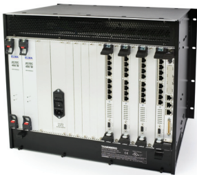
Rear View Multiple media processing boards and network interface boards

The TANDBERG Media Processing System (MPS) 800 is a feature rich, scalable multipoint control unit, gateway, or hybrid solution capable of supporting HD (720p). The MPS 800 is ideal for large enterprises, government agencies and service providers. Software upgrades provide investment protection, improving return on investment while increasing features and functionality.