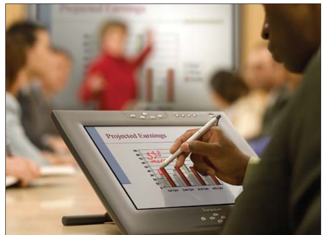
Control computer applications and write notes on the LCD screen while your audience sees the same image projected on a larger screen.